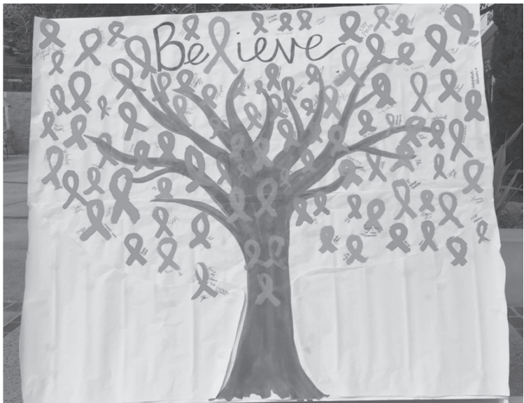
Concordia Students and Faculty created the photobooth backdrop on Oct. 12 in their support for those battling breast cancer.

booth together to show our support for BCA. You can still participate in Breast Cancer Awareness Month. On Wed., Oct. 26, the ASCUI team and