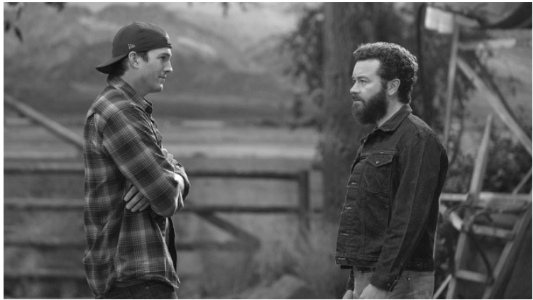
Ashton Kutcher and Danny Masterson

son why "The Ranch" is so unique is that you go into the first episode expecting it to be like a traditionally wholesome sitcom, then the first F-bomb is dropped (and I might add, it was perfect comedic timing on Elliott's part). Since it was in its pilot season, writers were careful not to push the profanity too far. But given the success and positive audience response, they were able to push the envelope a little further in part two and use profane language to make the dialogue more organic to the personalities of the characters. I admit it — I have not seen more than one season's worth of the beloved "That '70s Show," nor did I keep up with Kutcher's small screen return on "Two and a Half Men." I can say that after watching season one of "The Ranch," I quite enjoy Kutcher's performance, and tolerating his loud acting style is not a chore at all. Sure, he tries to add a "country" accent that is choppy and inconsistent, but the fact is Kutcher is actually a funny guy. I don't want to give too much away, but I'll let you know that this show is funny and worth at least a couple of hours of your free Saturday afternoon to quickly get through an entire set of episodes. Give it a shot and if you find yourself bored or it's not really your thing, just catch a younger Kutcher and Masterson on "That '70s Show" which is also streaming on Netflix.