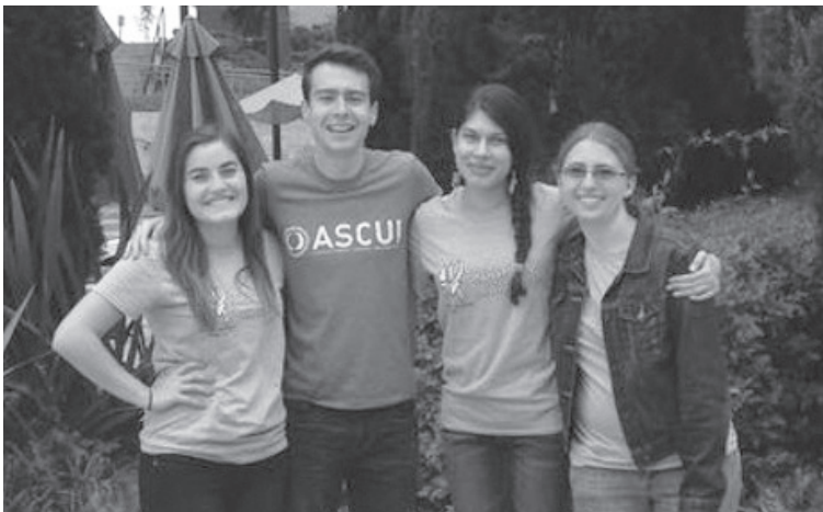
ASCUI and PHE's have teamed up this year for Breast Cancer Awareness month.

the Peer Health Educators will be outside of the Student Union with baby pumpkins that you can paint pink and display just in time for Halloween. Also, the Caf will be delivering some fun pink treats.