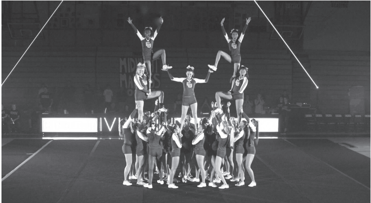
The Cheer Team at last years midnight madness