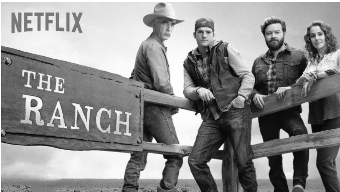
Sam Elliott, Ashton Kutcher, Danny Masterson, and Debra Winger

If you're a fan of Ashton Kutcher and like short 22-minute shows you can binge-watch in a single weekend, then "The Ranch" is for you. This Netflix original is about Colt Bennett (Kutcher), a semi-pro football player with a dwindling career who returns home to his family ranch after a nearly two-decade absence. Just to start, I am becoming a huge fan of Netflix original shows. I've watched "Orange is the New Black" and "House of Cards." Both have incredible evolving plots. The problem is they can both get pretty intense at times. "Stranger Things," one of the most talked about shows right now, is next on my list and I'm sure it gets just as intense. So before I commit to another one of those emotionally draining roller coasters that we keep calling "shows," I decided to escape the realities of school and Orange County living by diving into this sitcom about a small town with big personalities. The first episode is about